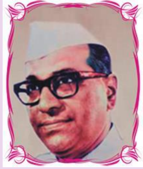
Padmashree Bhausaheb Vartak