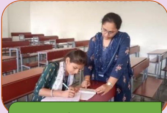
Special attention to weaker student